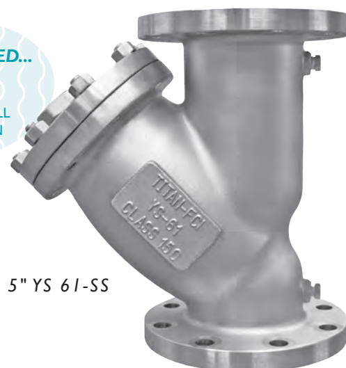
5" YS 61-SS